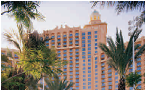
JW MARRIOTT ORLANDO GRANDE LAKES 4040 Central Florida Parkway Orlando, FL 32837

Please note that there are a limited number of rooms available at the group rate which will be reserved on a first come first served basis. 7x24 Exchange makes every effort to reserve the appropriate number of room nights for attendees, however we cannot be responsible if the room block sells out prior to May 12, 2006. In the event of a sell out 7x24 Exchange will recommend nearby accommodations.