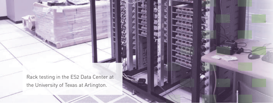
Rack testing in the ES2 Data Center at the University of Texas at Arlington.