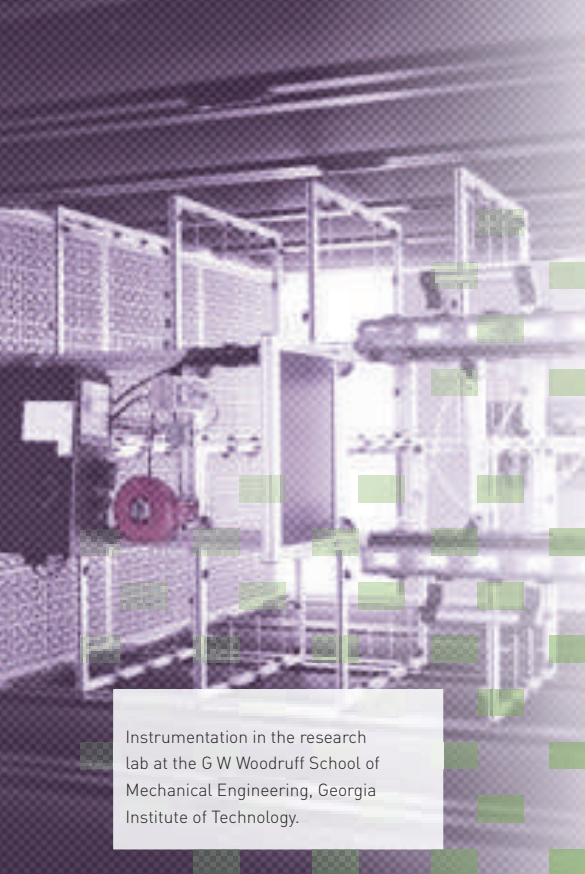
Instrumentation in the research lab at the G W Woodruff School of Mechanical Engineering, Georgia Institute of Technology.